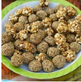
Loos I sising li Dubi